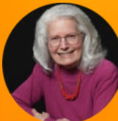
PMH Atwater, LHD