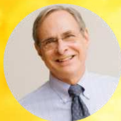
Bruce Greyson, MD

IANDS Online Conference on September 4, 2021 at 6:00 pm EDT