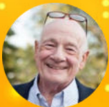
Raymond Moody, MD, PhD