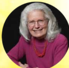
PMH Atwater, LHD